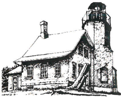
Fruitland Township White River Light Station Museum