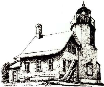
Fruitland Township White River Light Station Museum