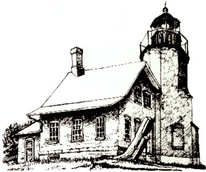
Fruitland Township White River Light Station Museum