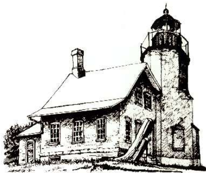
Fruitland Township White River Light Station Museum