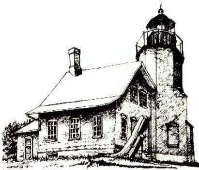
Fruitland Township White River Light Station Museum