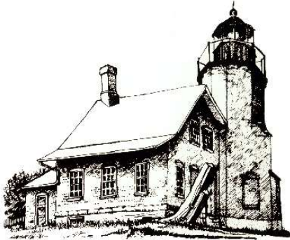
Fruitland Township White River Light Station Museum