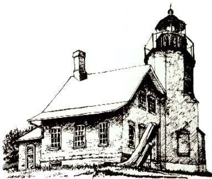
Fruitland Township White River Light Station Museum