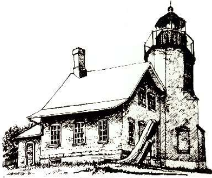
Fruitland Township White River Light Station Museum